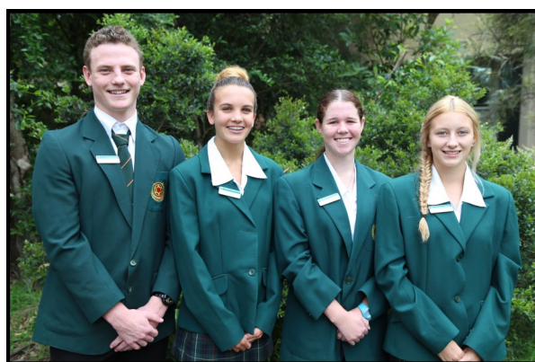
2016 Senior SRC Leadership Team

Illawarra Sports High School Gura St, PO Box 78, Berkeley 2506 P 02 4271 1099 F 02 4271 3511 E illawaspor-h.school@det.nsw.edu.au www.illawaspor-h.school@det.nsw.edu.au