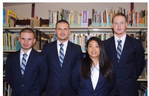
2017 Senior SRC Leadership Team

Illawarra Sports High School Gura St, PO Box 78, Berkeley 2506 P 02 4271 1099 F 02 4271 3511 E illawaspor-h.school@det.nsw.edu.au www.illawaspor-h.school@det.nsw.edu.au