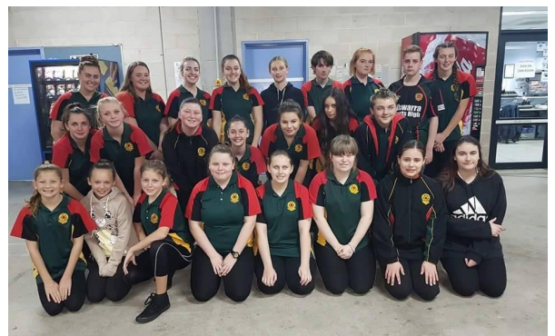
Southern Stars 2016

Band students are tutored by teachers from the Wollongong Conservatorium of Music and the school choir practices every Monday.