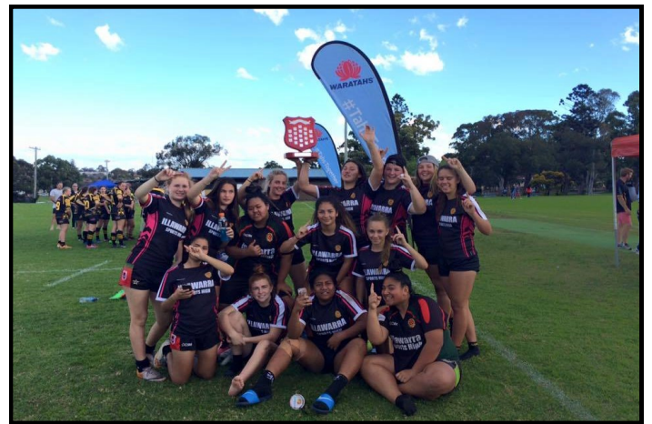
Winners 2016 NSWCHS girls Rugby Union 7s State Final