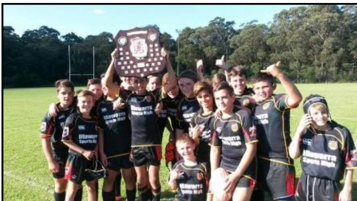
2015 U13's Boys Rugby League Country Cup Champions

Football, Rugby League, Netball, Basketball, Baseball and All Codes (AFL, Oztag, Rugby League, Rugby Union, Touch and Track & Field) and Surfing.